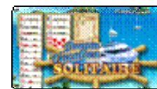
Dream Vacation Solitaire

Note: The above game titles are a sample of casual games provided by Oberon. The actual games to be made available on G-cluster will be determined later.